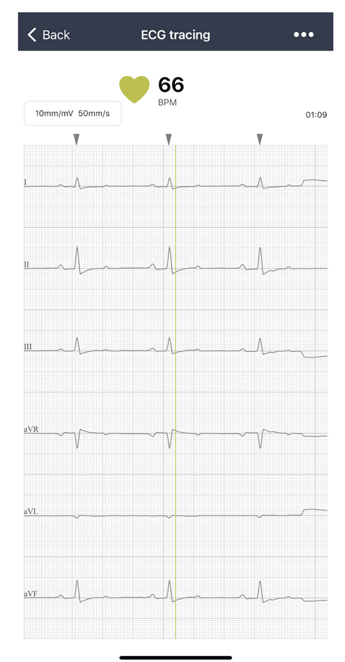
FIGURE 2 Smartphone display during an electrocardiographic (ECG) recording obtained with the smartphone-based ECG device used in this study. Note that all six leads (i.e., leads I, II, III, aVR, aVL and aVF) are simultaneously recorded, with a paper speed of 50 mm/s and a paper sensitivity of 10 mm/mV

A board-certified cardiologist (G. R.) evaluated each ECG tracing and manually measured intervals and amplitudes using a calliper and ruler with 0.5-mm graduations. Tracings were considered acceptable for interpretation if baseline artefacts were absent for at least 80% of the recording. Initially, the cardiac rhythm was analysed and classified as sinus or pathological rhythm. Then, the HR in beats per minute (bpm) was calculated by determining the number of QRS complexes in a 3-second interval and multiplying this number by 20. For the purpose of this study, the classification of the heart rhythms/rate included <sup>36–40</sup>: