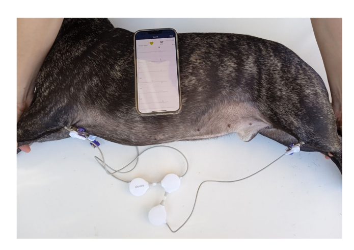
FIGURE 1 Electrocardiographic (ECG) recording in a French Bulldog using the six-lead smartphone-based ECG device. Although the smartphone is usually held by the vet during the ECG, in this case, it was gently placed on the dog's chest to show readers the real-time recording guaranteed by the wireless transmission

the left forelimb, the neutral black electrode on the right hindlimb and the ground green electrode on the left hindlimb.<sup>25</sup> In the case of the s-ECG, three leads were available (i.e., the red, the yellow and the green one). As in the case of the st-ECG, these leads were connected to atraumatic flattened metallic alligator clips. The leads of the s-ECG were connected close to the clips of the st-ECG and attached to the corresponding limb as previously described (Figure 1). In the case of both devices, alcohol was applied to maintain electrical contact with the skin. In both the st-ECG and the s-ECG, six-lead ECG tracings (i.e., leads I, II, III, aVR, aVL and aVF) were obtained for 30 seconds. In the case of the st-ECG, the ECG tracings were printed with a paper speed of 50 mm/s and a paper sensitivity of 10 mm/mV. The setting of the st-ECG included a sampling frequency of 600 Hz for acquisition, a 60 Hz low-pass filter and a 0.05 Hz high-pass filter. In the case of the s-ECG, the setting included a sampling frequency of 250 Hz for acquisition and a filter range of 0.5-40 Hz. In this case, tracings were recorded with an iPhone 13 (Apple, USA), automatically digitalised by the device with a paper speed of 50 mm/s and an amplitude of 10 mm/mV (Figure 2), archived as a PDF and printed for subsequent ECG analysis.